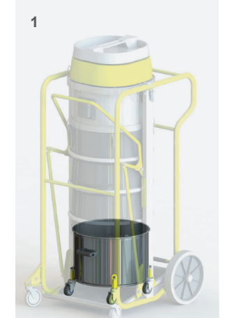
RONDA® 2800H with a 40 litres container. Well qualified if you want to collect dust etc. directly into a container.