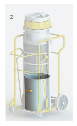
RONDA® 2800H with a 65 litres container. Collection of large quantities of dust directly into a container, when you work with slightly voluminous dust, such as wood dust.